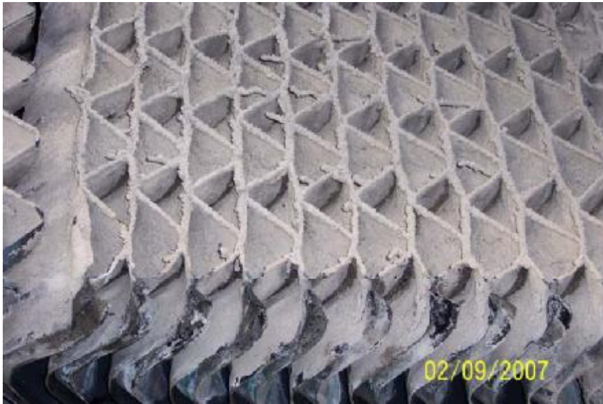
Top-side drift screens on day 1 of the evaluation, encrusted with scale.