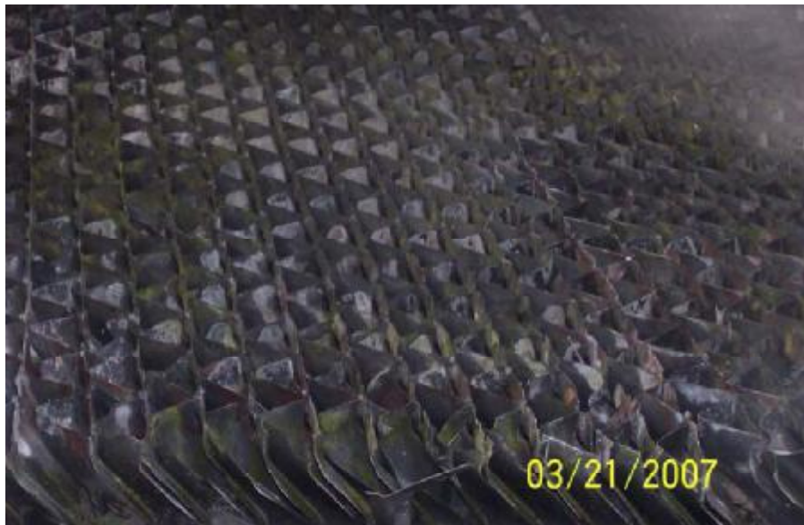
Top-side drift screens on day 41 of the evaluation, cleaned and scale-free due to Micro-Nice® D-5's action through tower sprays with no hosing or power-washing.